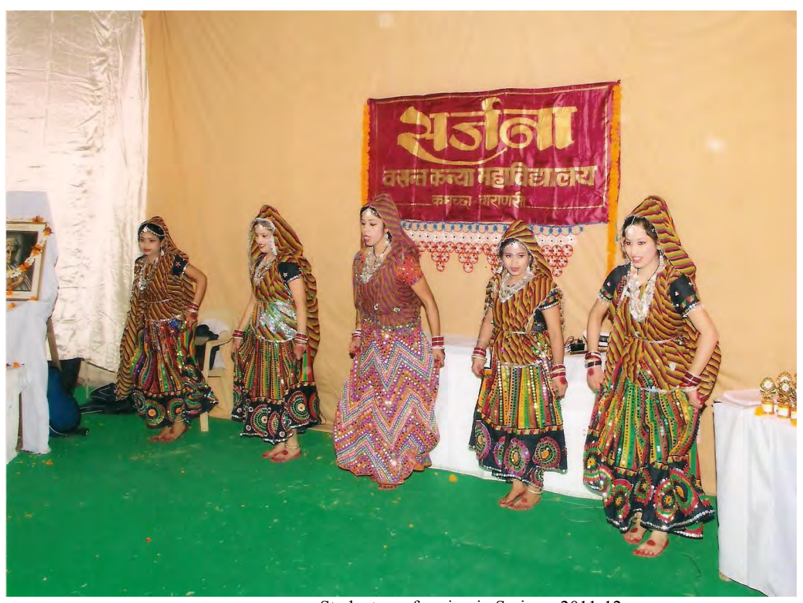
Students performing in Sarjana, 2011-12.