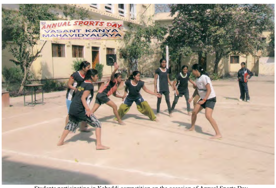
Students participating in Kabaddi competition on the occasion of Annual Sports Day.