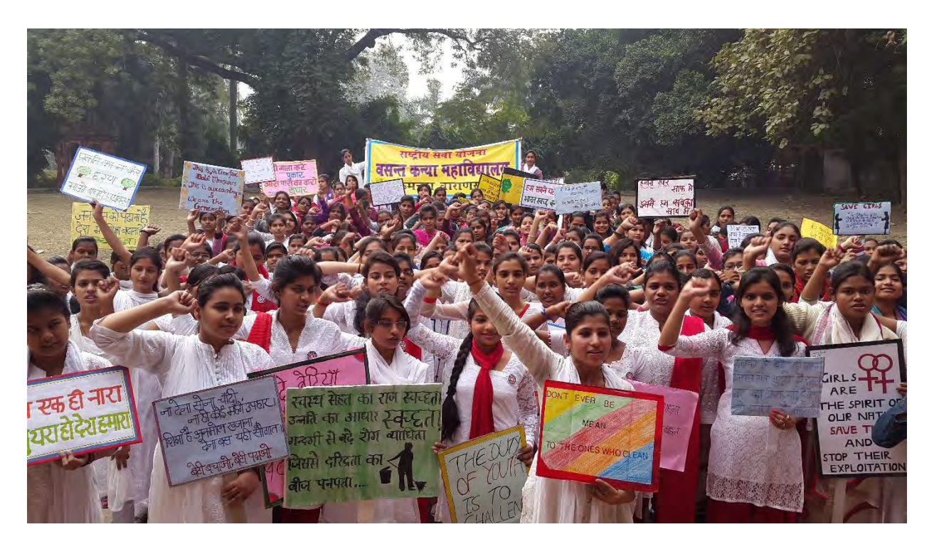
NSS Volunteers taking out a rally to create awareness regarding health and other social issues