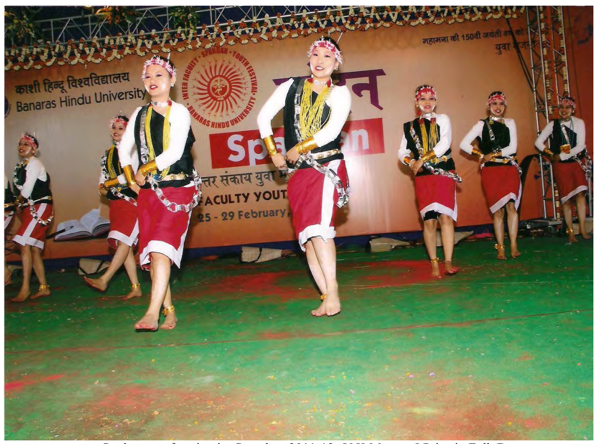
Students performing in Spandan, 2011-12. V.K.M. won I Prize in Folk Dance.